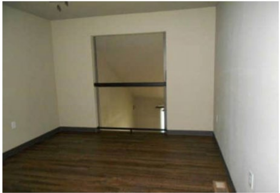
2BR/1BA loft unit loft space