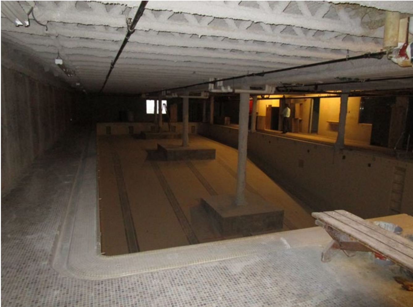
Old swimming pool or a structural support system